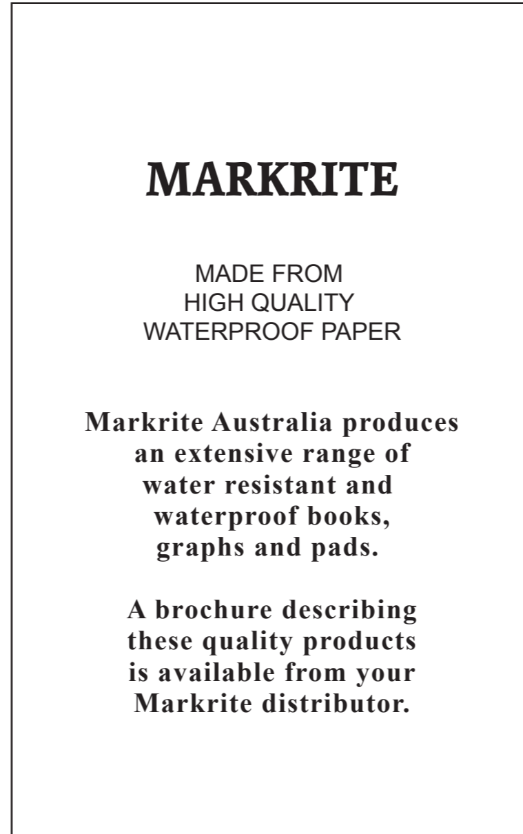
size: 180mm x 120mm